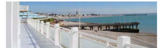
Palais des Régates, Sainte Adresse