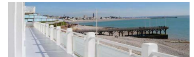
Palais des Régates, Sainte Adresse